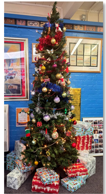
Christmas spirit has arrived at SJS! It has started to look very festive around school with the decorations up.