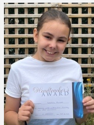
5G—Sakhira For great enthusiasm during our P4C discussions.