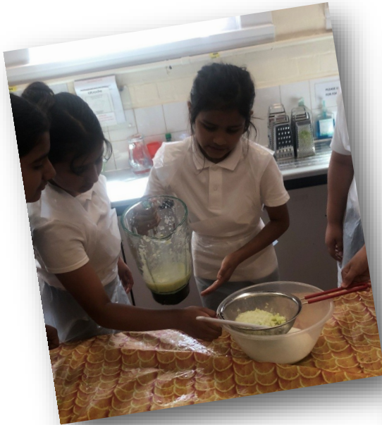
Year 3 enjoyed preparing and tasting new ingredients and made a healthy salad to take home.

As part of their topic on South America, Year 5 made Brazilian Lemonade (Limonada suíça), a cold drink from Brazil made of limes, condensed milk, ice and water. It was surprisingly refreshing in a sweet and sour way!