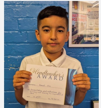
5G - Komail

For her creativity, independence and self-motivation in producing her self-portrait.